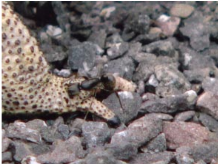
Ants render their victim powerless by injecting it with formic acid

probably lose interest and leave the spot. The Toad is injured but triumphant at the end of it. It slowly moves along in small and unsteady leaps, but with courage and faith in life and itself! For once, it has defeated death and honoured the spirit of life and what could be a greater reward than life itself.