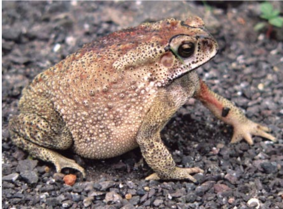
Common Indian Toads defend themselves against approaching predators by inflating themselves, making it difficult for the adversary to hold the toad.