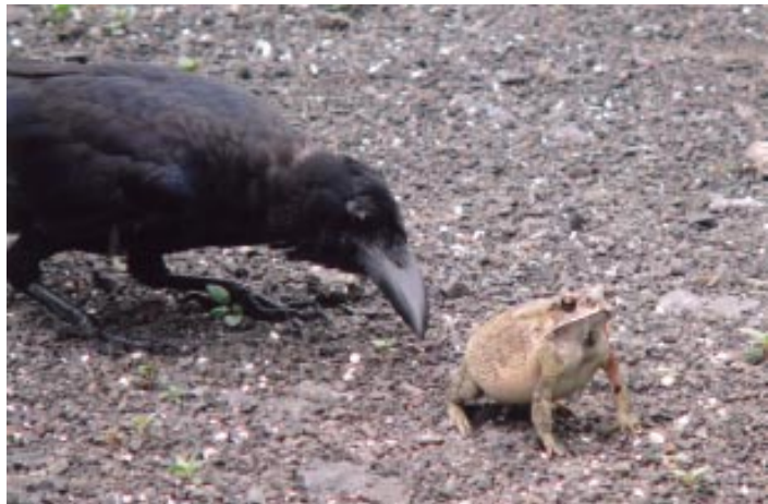
Heavy billed and having a deep, hoarse 'caw', Jungle Crows are known to be omnivorous

He does not mean to interfere in nature's course, but the little one has fought too many battles, too long and deserves a chance at life. The Crows